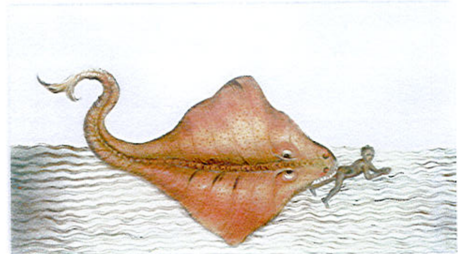
Enslaved African Pearl divers faced the terror of being attacked by Sharks and Manta Rays From the Drake Manuscript, ca 1560.