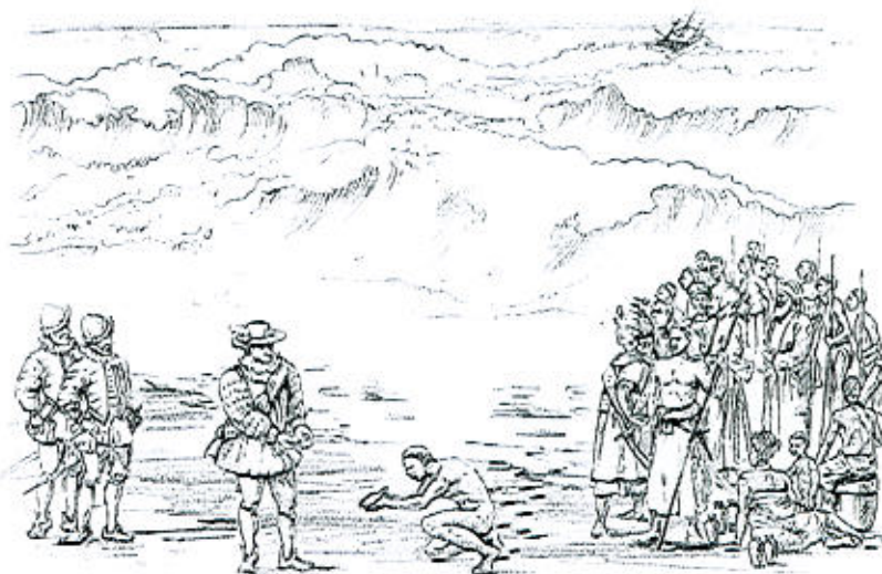
Ca'da Mosto receiving the message from the best swimmer in the world.

Sometimes I lost sight of them, and thought they were swallowed up by the waves. At last one of the two could no longer resist the force of the water, turned his back on the danger, and returned to the shore. The other, more vigorous, after battling for more than an hour with the wind and the waves, passed the bank, carried my letter to the ship, and brought me the answer. I dared hardly touch it, looking upon it as such a wonderful and sacred thing. And thus I learned that the people of Budomel are the best swimmers in the world."