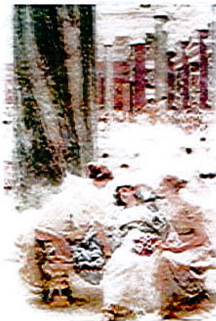
Depiction of the Baths of the Emperor Caracalla by Victorian artist, Sir Lawrence Alma-Tadema. Covering over 25 acres, it was the most luxurious swimming complex ever built, including a 50-meter long tank with columns of marble and gold.