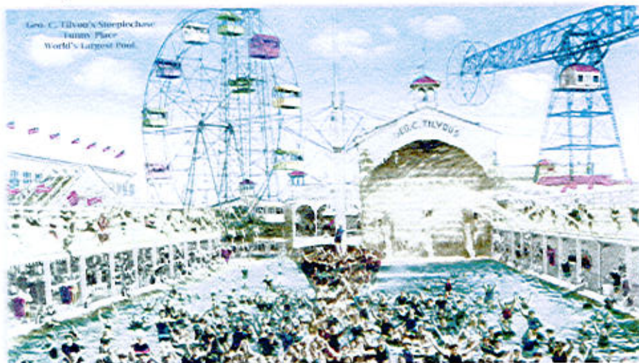
Steeplechase Park's swimming pool was the most popular attraction at Coney Island, N.Y. It was one of hundreds of giant aquatic playgrounds that attracted White people to swimming across America, in the first half of the 20th Century.