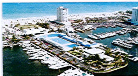
International Swimming Hall of Fame

catered primarily to competitive swimming enthusiasts and offered few of the inducements and amusements that attracted non-swimmers to pools in the first half of the 20th Century. Not surprisingly, most swimming pools today are as segregated as they were before 1964.