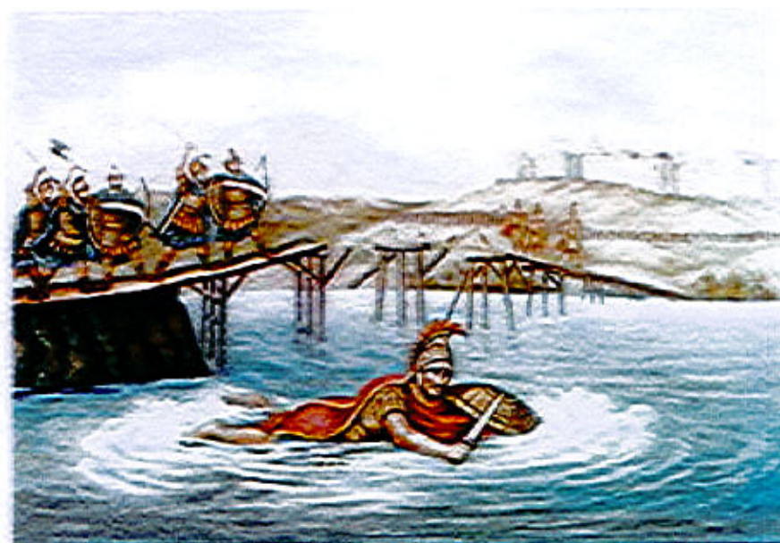
After holding off the Etruscan invaders while the Romans tore down the Sublican Bridge, Horatio Cocles, swam safely across the Tiber in full armor and became ancient Rome's greatest hero.