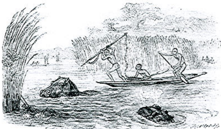
Among the aquatic hunting techniques Europeans learned from African watermen was the harpooning of whales.

When the first European explorers reached present day Mauritania, on Africa's west coast, they were met by curious Black skinned Africans who paddled out to greet the strange ships in their canoes. The first instinct of the Europeans was lower their long boats to capture human specimens to take back to Portugal. But it was not all easy for the Portuguese kidnappers, for the Africans were expert watermen who "swam and dove like cormorants" so that they [the Portuguese] could not get hold of them until resorting to the use of boat hooks. Later, Europeans would attribute