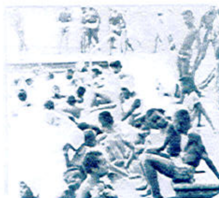
Above: "Colored" pools were not "separate but equal." Where communities did provide swimming facilities for Blacks, they were typically little more than shallow wading pools, without the amenities and attractions found at White pools.