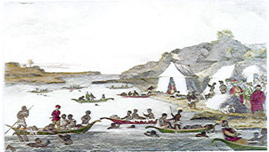
Enslaved African Pearl divers off the coast of Venezuela, ca 1520. Artist unknown.

Swimming and Diving. It is to them the Ladies are obliged for their Ornaments of Pearl; they are the Divers who fish for them; they are also very useful for recovering Anchors and Merchandises that have been cast away.”