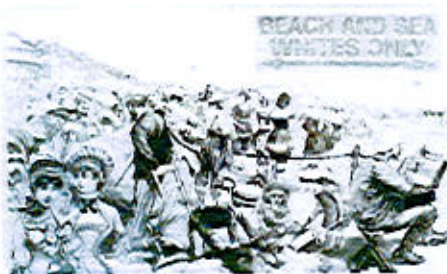
In the 1870's Whites discovered the beach, the health benefits of learning to swim, and drowning was recognized as a public health issue.

After the civil war, Whites began to take an interest in swimming as a public safety issue to reduce the high rates of drowning and Whites exclude Blacks from the best pools and safest beaches. The pools of this era were enormous aquatic playgrounds that were the epicenter of social life for White society in nearly every city and small town in America. National Learn-to-Swim campaigns offering free swimming lessons were immensely popular. African Americans were generally relegated to small pools at "Colored YMCAs" or dangerous swimming holes. As a result, during this era, the rich tradition of swimming was excised from African American culture. At the start of WWII, a study showed that 85% of Black sailors were unable to swim, compared to only 10% of Whites – almost a complete reversal of statistics in one hundred years.