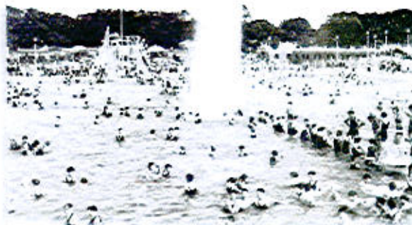
Audubon Park Pool, New Orleans

Swimming facilities built after 1960, like the International Swimming Hall of Fame,